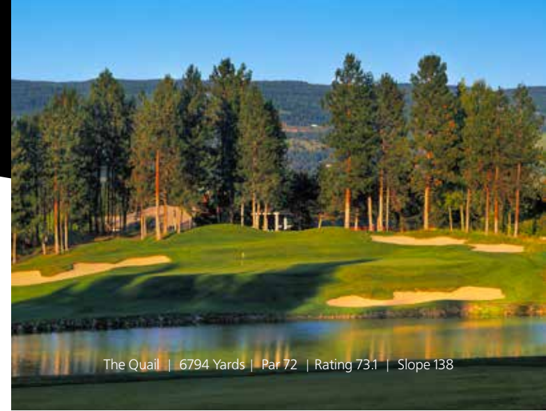
The Quail | 6794 Yards | Par 72 | Rating 73.1 | Slope 138

The routing climbs through forested hills on a plateau overlooking the Okanagan Valley. The Bear's signature hole comes at number three, 453 yards of challenge requiring a combination of accuracy and distance to avoid two bunkers en route to the green. While the course boasts an extensive collection of sweet holes, numbers thirteen through fifteen – playing over the blue waters of Lake Mclvor – are the real honeys here. More than 150,000 cubic metres of earth were moved to create the lake and the dramatic topography around it, yet the course maintains a perfect harmony with the natural terrain. 🐾